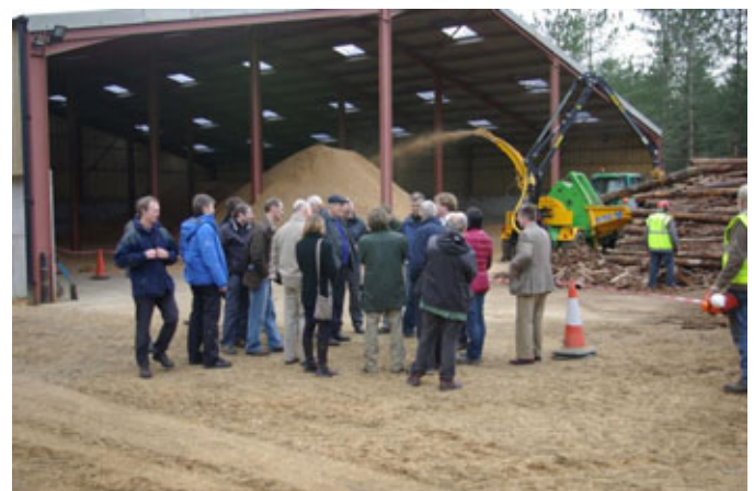
Some of the delegates on the field visit to Hinton Estate seeing woodfuel production and distribution from formerly undermanaged estate woods.