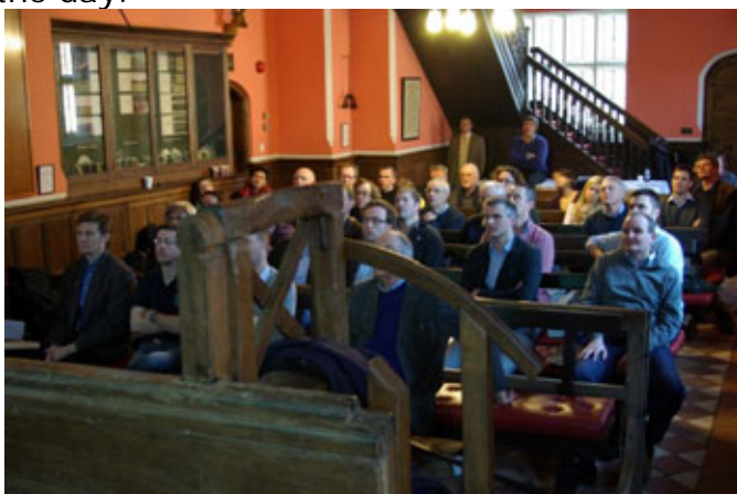
Delegates receiving presentations in the Verderers Court, New Forest

Delegates: 36 delegates (excluding WhS project partners) attended the workshop, most attending both days, regrettably a small number of people who had booked did not attend on the day.